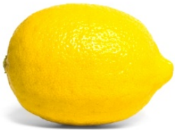
lemon níng méng