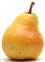
pear lí zǐ