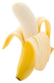
banana xiāng jiāo