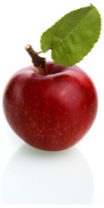
apple píng guǒ