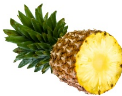
pineapple bō luó