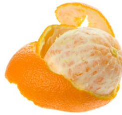
orange chéng zi