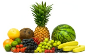
fruit shuǐ guǒ