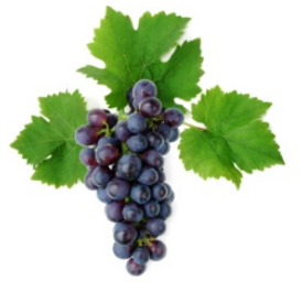
grapes pú táo