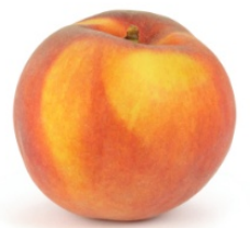
peach táo zi