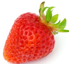
strawberry cǎo méi