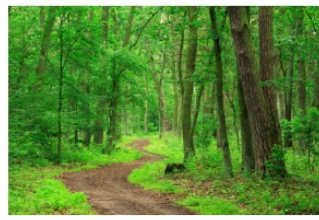
forest sēn lín