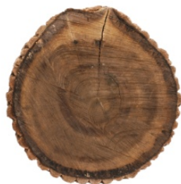
wood mù tou