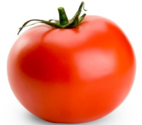
tomato fān qié