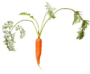
carrot hú luó bo