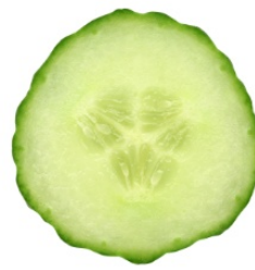
cucumber huáng guā