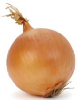
onion yáng cōng