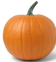
pumpkin nán guā