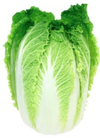
Chinese cabbage bái cài