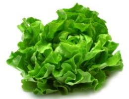
lettuce shēng cài