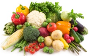
vegetables shū cài